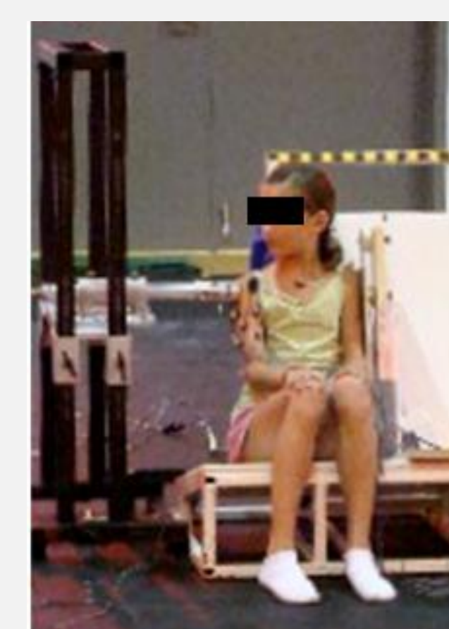
Figure 3. Final set-up with the contralateral load-cell wall